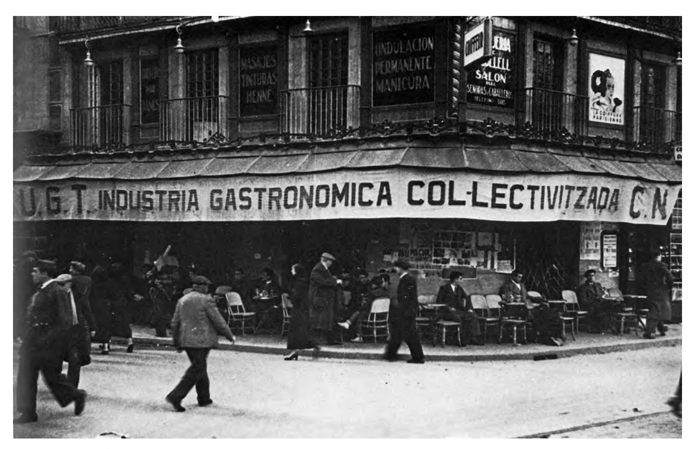
FIGURE 2. Image of one of the restaurants that was collectivised, located on the corner of the Rambla with Carrer Nou de Barcelona, known as "El Trincall".

It should be borne in mind that banking was supervised and controlled but not collectivised. However, the